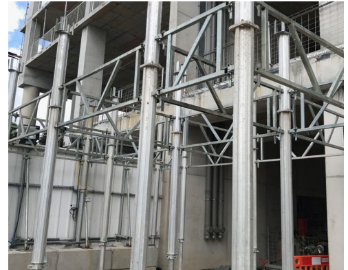
Aluminium components make High load capacity reduces the Compatible with H20 Timber amount of equipment required.