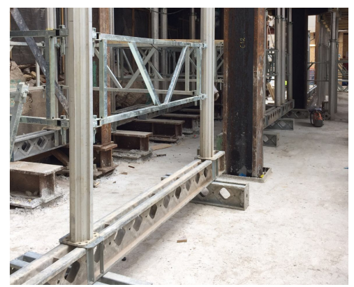
Beam and MKII Soldiers.