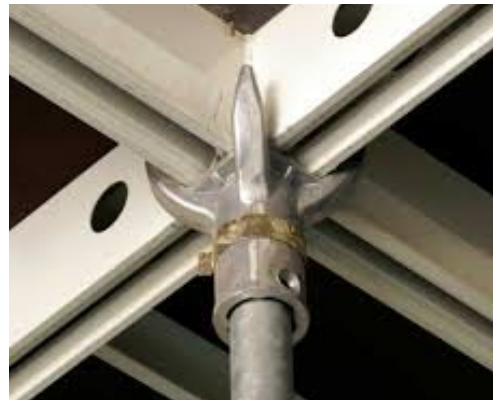
The system's adaptable configurations are designed to meet a variety of site and user specifications efficiently.