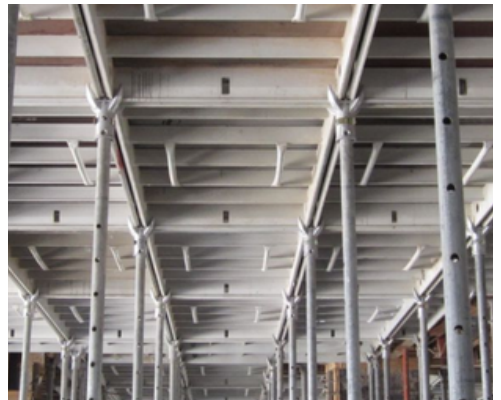
Streamlined design, featuring only a few components, enables rapid setup and takedown.