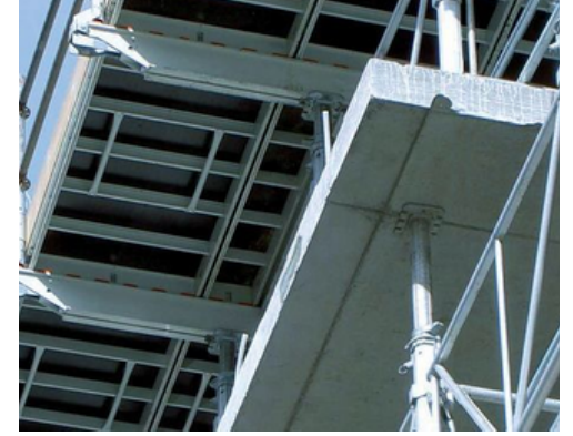
Assembling panels and beams from below the soffit lowers the risks associated with working at height.