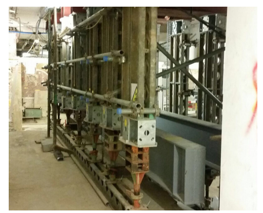
1000 kN permissible load makes Megashor ideal for heavy duty falsework, and façade retention