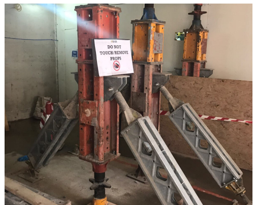
Works perfectly alongside Superslim Soldiers to provide ultimate flexibility.