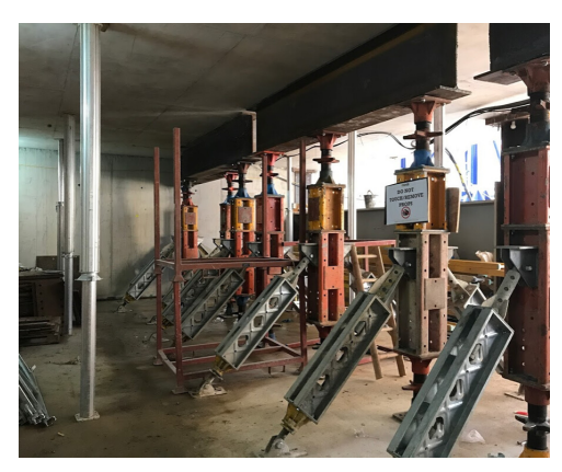
Can be assembled into props, towers and trusses of almost any length due to the variety of sizes and accessories