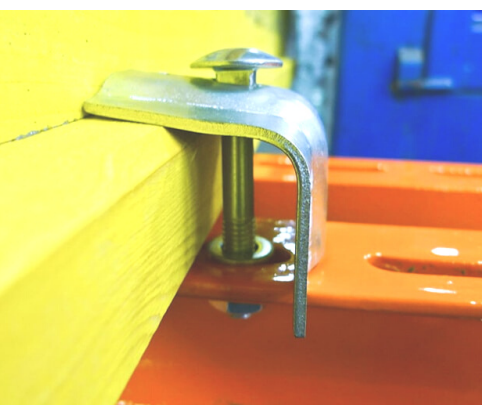
Short forming times cut labour costs down.